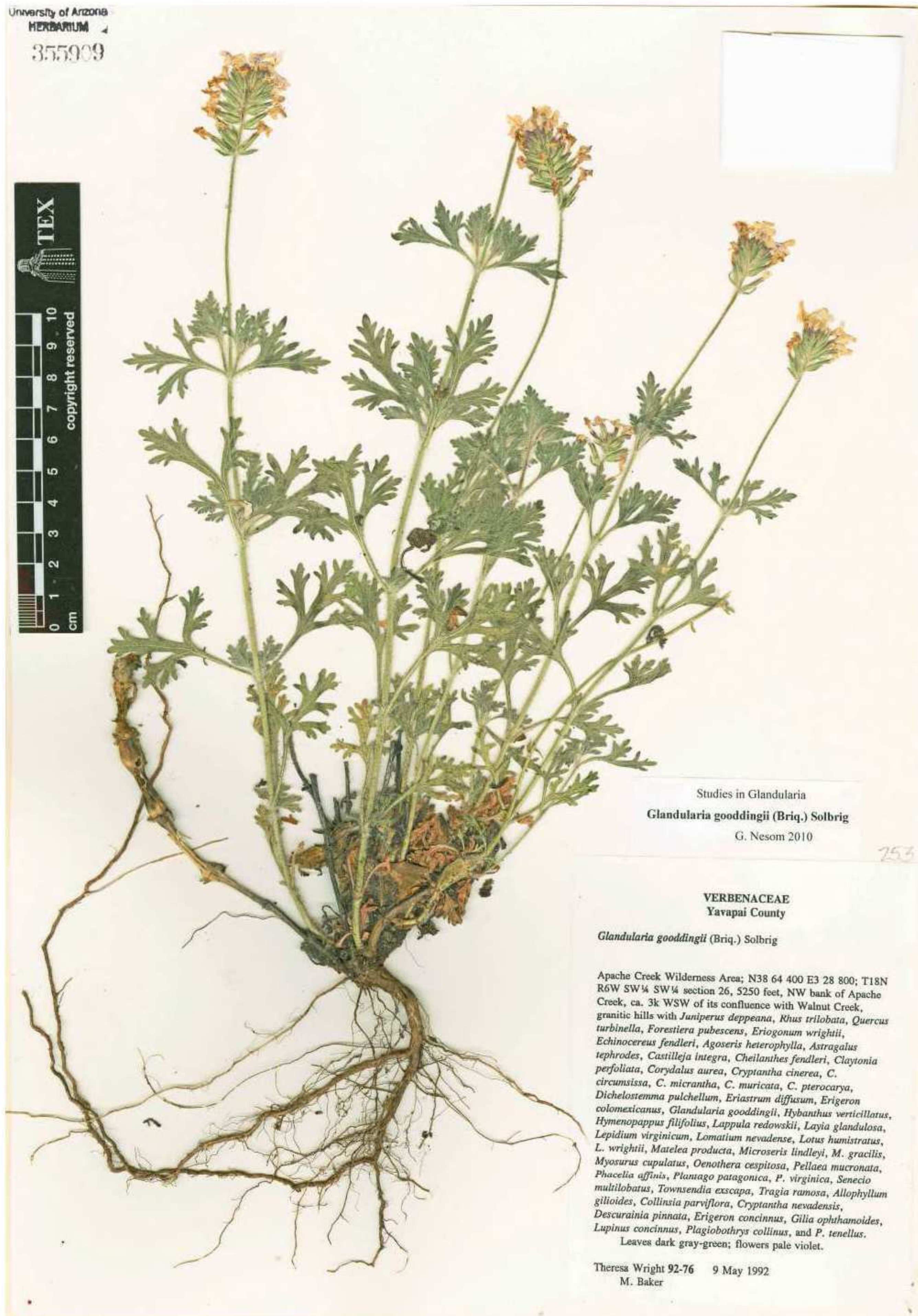
Figure 6. Glandularia gooddingii , leaves strongly dissected, bipinnatifid.